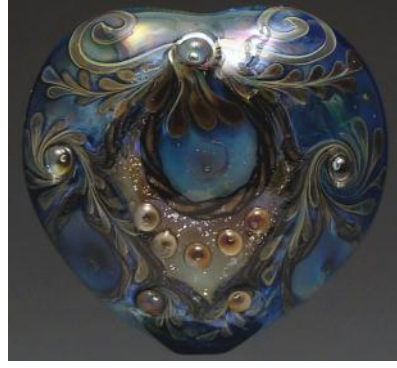
Moonlight Waltz Heart