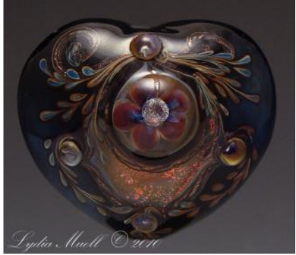
Plutonic Love Heart