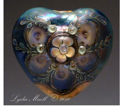
Sunset Opal Heart

Harmonic Hearts is a collection of three tutorials, including step by step directions on how to create the Moonlight Waltz Heart, Plutonic Love Heart and the Sunset Opal Heart. Due to their complexity, these tutorials are written for advanced level lampworkers. Each bead requires four to five different “silvered glasses”, so prior experience working in a reduction flame is recommended. Raking, layering, shaping, and stringer control are additional recommended skill sets.